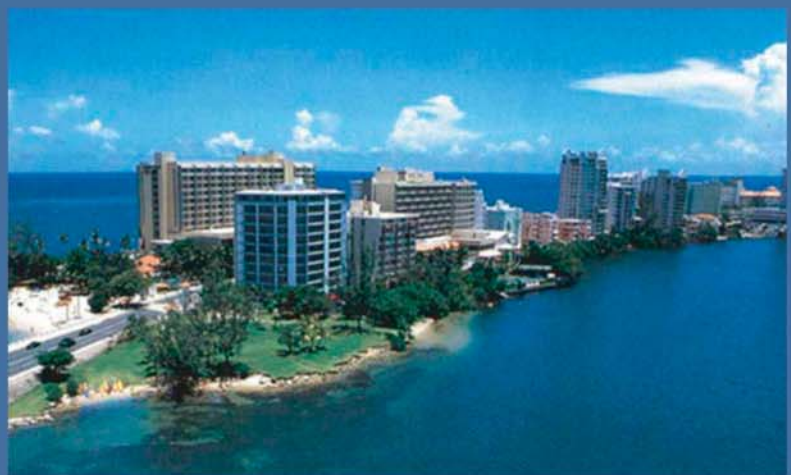
Condado, Puerto Rico