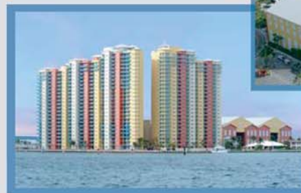
Marina Grande at Riviera Beach & Loggerhead Club and Marina.