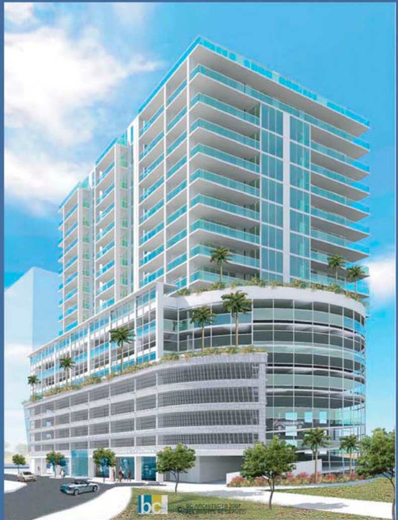
Regency Parc Plaza