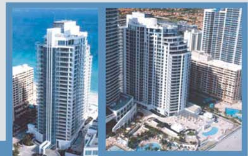
Diplomat Oceanfront Residences

BCA would like to thank those who were involved with these two projects, including Suffolk Construction , Pavarini Construction , JM Engineers , CHM Structural Engineers , Hershell Gill Structural Engineers , as well as all of the other individuals and teams who made these projects a success. ■