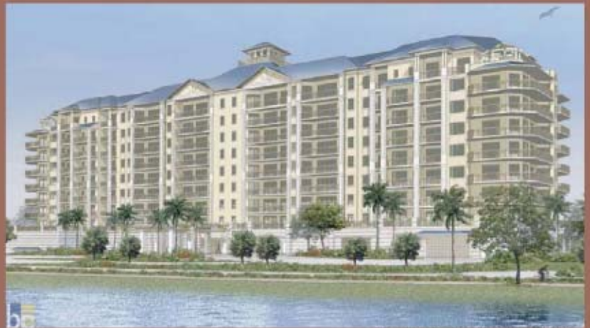
Seven Shores: 10 Story Building