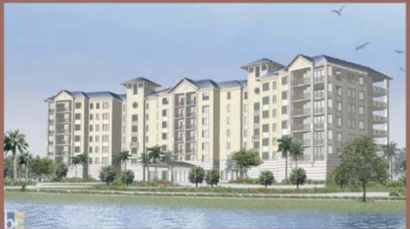
Seven Shores: 7 Story Building