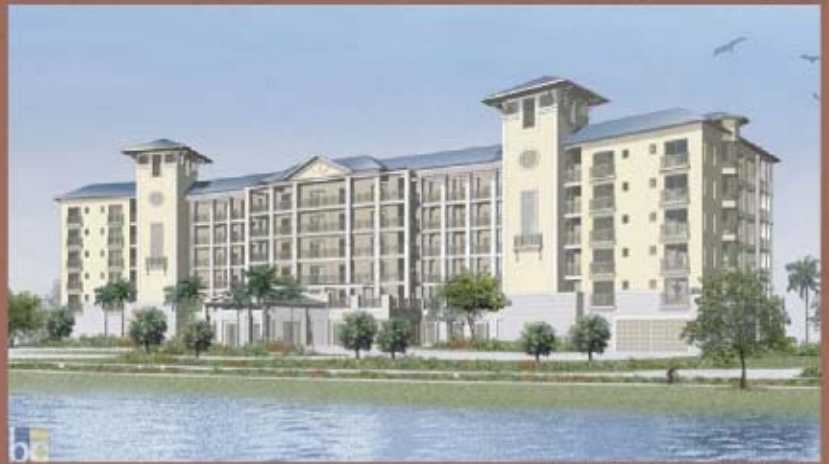
Seven Shores: 6 Story Building