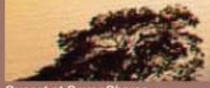
Sunset at SevenShores